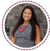
Emily McCorkle Pamplin College of Business